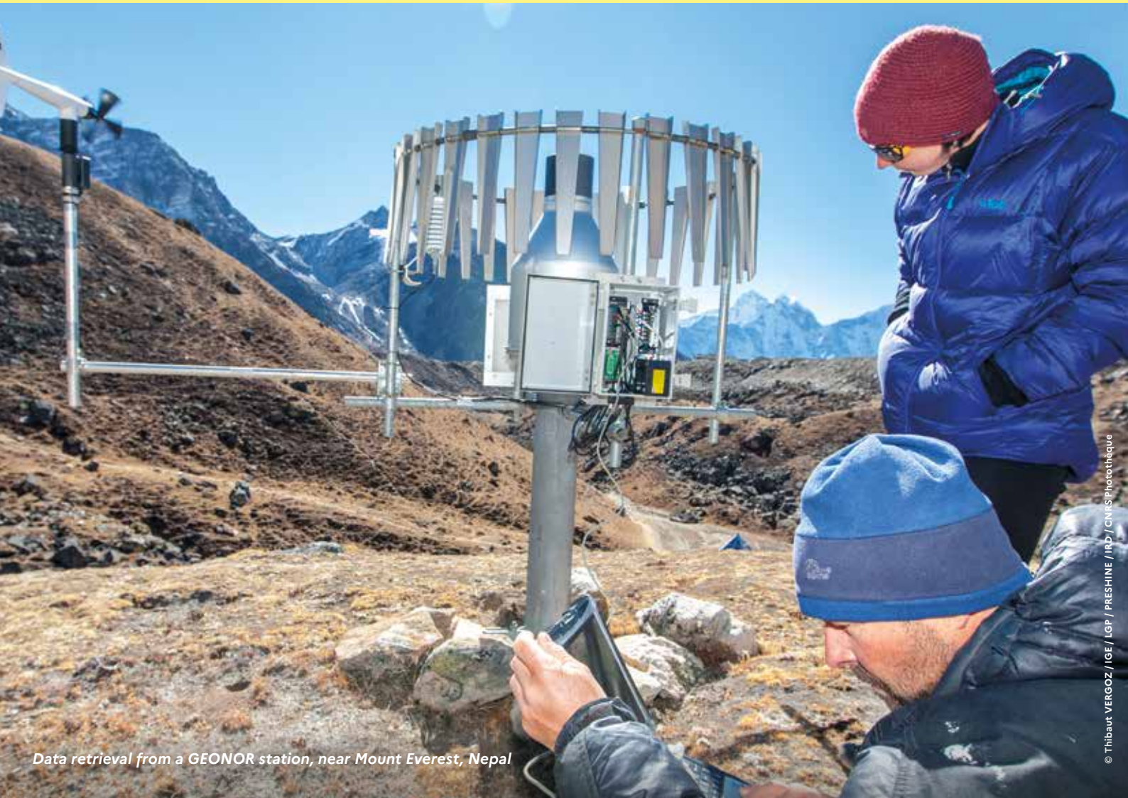
Data retrieval from a GEONOR station, near Mount Everest, Nepal