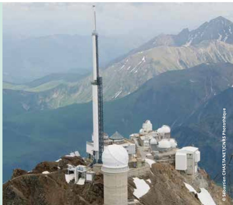
Aerial view of the Pic du Midi Observatory