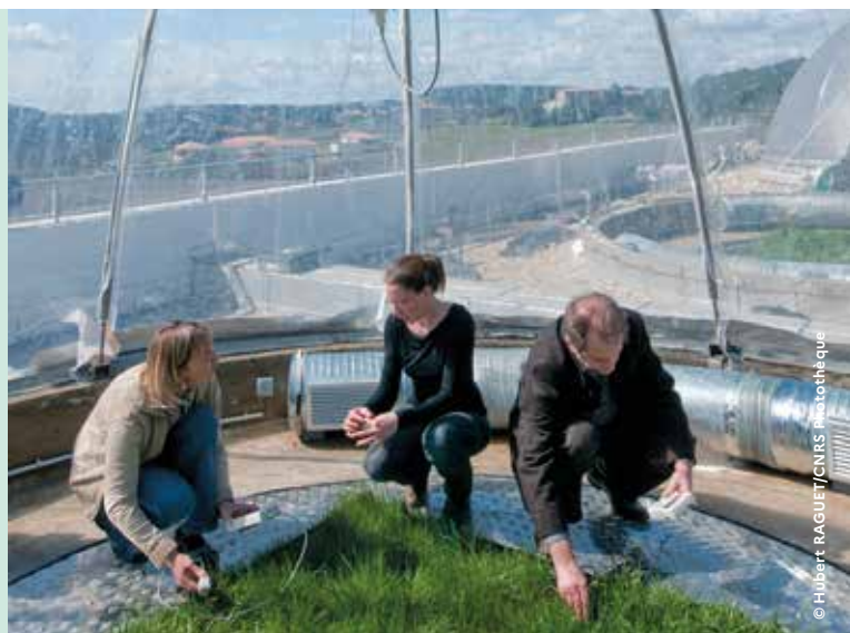
Observation of plant behavior at the European Ecotron in Montpellier

data sets for each field. This involves encouraging dialogue between the scientific domains to facilitate integrated ecosystem approaches. For example, this can be useful when studying interactions between the ocean and the atmosphere, or the continental surface and the atmosphere.